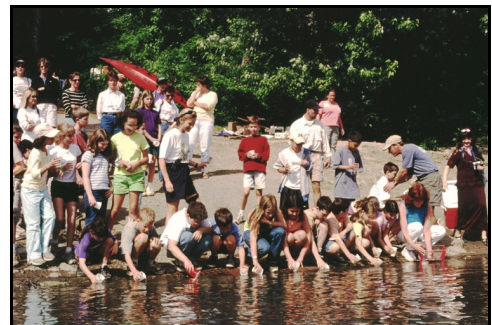
Students participating in the Schools-in-Schools program, in cooperation with the Chesapeake Bay Foundation and others, stocking their shad-fry near Old Anglers Inn.

The ICPRB and USFWS successfully completed the eight-year American shad stocking program, a fishway (structure for fish to swim upstream) was constructed at Little Falls Dam in 2000 by the U.S. Army Corps of Engineers, and our understanding of the shad in the Potomac River has