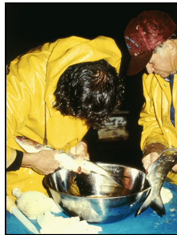
Field stripping and fertilization of shad eggs for delivery to the USFWS's Harrison Lake Hatchery.