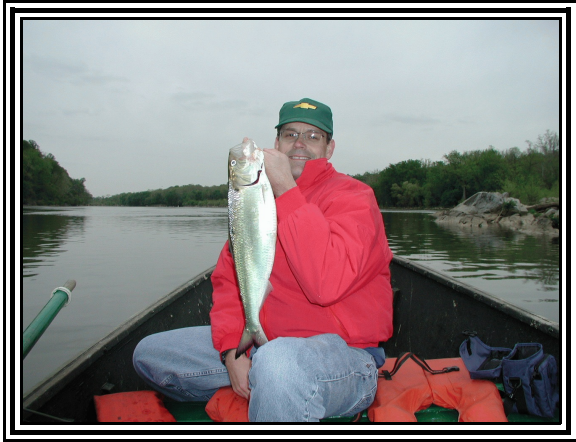
American shad are back in the Potomac River and fishing for them is growing increasingly popular, but they must be released unless harvest moratoria are lifted.

shad also have become substantially more numerous in the Potomac, eclipsing records for nine of the last ten years in Maryland's shore monitoring surveys that have been performed since 1959 (Figure 2).