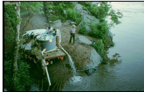
USFWS stocking some of the 15-million shad-fry at the Potomac River's Mather Gorge with the cooperation of the National Park Service.