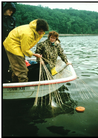
Gill-net collections of spawning shad in the tidal Potomac with the help of volunteers and Virginia watermen.