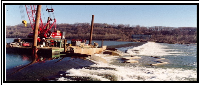
Construction of the Little Falls Fishway.

The project has been supported from its inception in 1995 by a number of collaborating agencies and organizations, including the Virginia Chesapeake Bay Restoration Fund, Maryland Chesapeake Bay Trust, Potomac River Fisheries Commission, Living Classrooms of the National Capital Region, National Fish and Wildlife Foundation, U.S. Fish and Wildlife Service, U.S. Army Corps of Engineers, Chesapeake Bay Program, Maryland Department of Natural Resources, ICPRB, and private donations from Mirant Power and members of the Congressional Sportsmens Caucus.